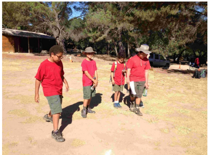
Dirt Check. Yup plenty of it.