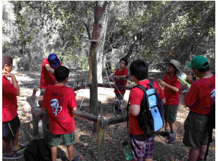
Not sure what is going on here!