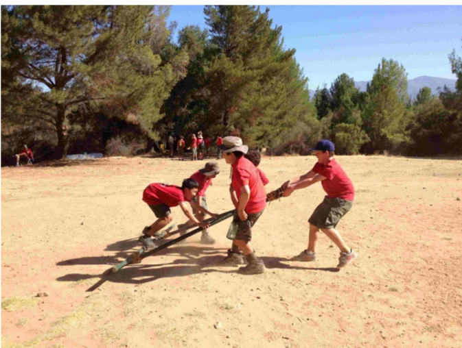
Moving fast. Pioneering – Constructing and running some sort of historical transportation device