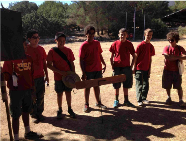
Our Scouts participating on different camp events.