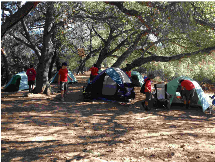
The scouts are settling into camp, setting up tents.